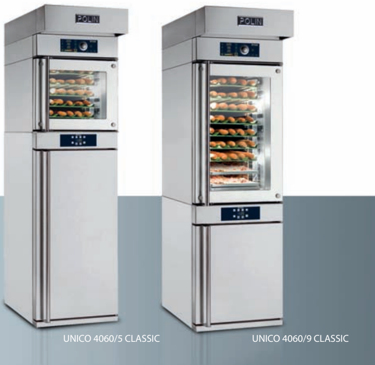
UNICO 4060/5 CLASSIC