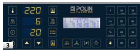
Keypad with 100 programmes, 9 phases each, with a large 4-line LCD.