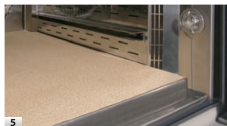
Refractory cooking surface for baking products directly on the surface.