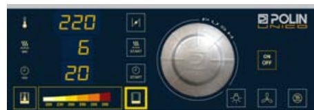
Standard keypad with automatic steam damper and temperature control of the deck.