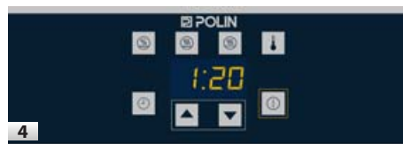
Proofer keypad with set of time, temperature, humidity of the proofer. Two colour display (green humidity, red temperature), for a prompt reading.