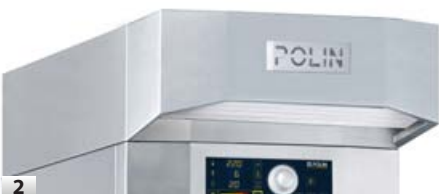
Dry air-cooled steam condenser with low consumption (0.36 kW), without using refrigerated assemblies and with no water consumption.